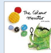
The Colour Monster